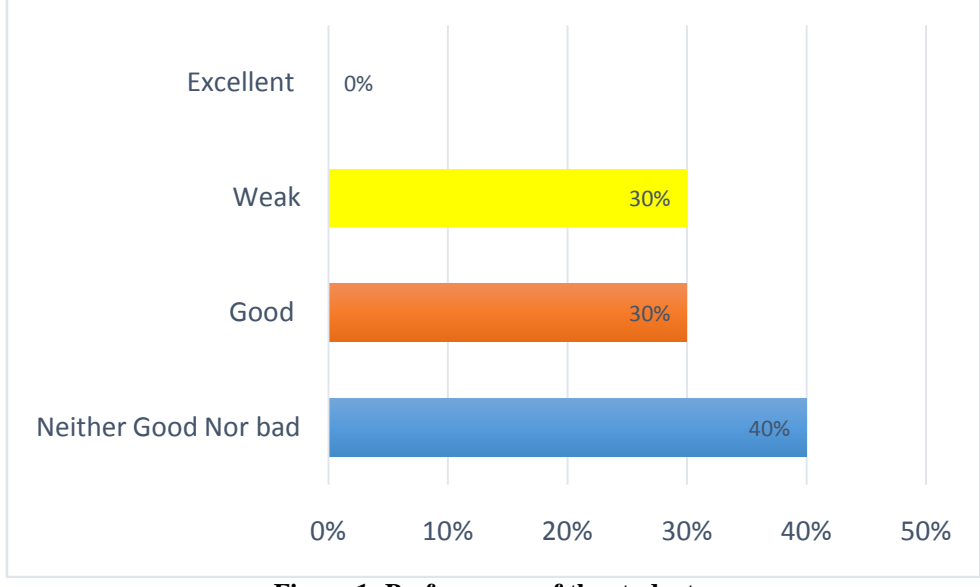
Figure 1- Performance of the students.